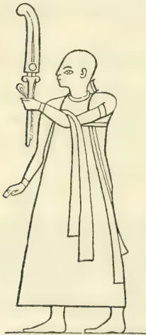
A GOVERNOR OF RAMESES IX. From Erman, Life in Ancient Egypt .